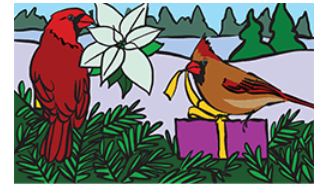
DECEMBER BIRTHDAYS & ANNIVERSARIES

If you would like other new dates added, please just send an email to the church office. 😊😊